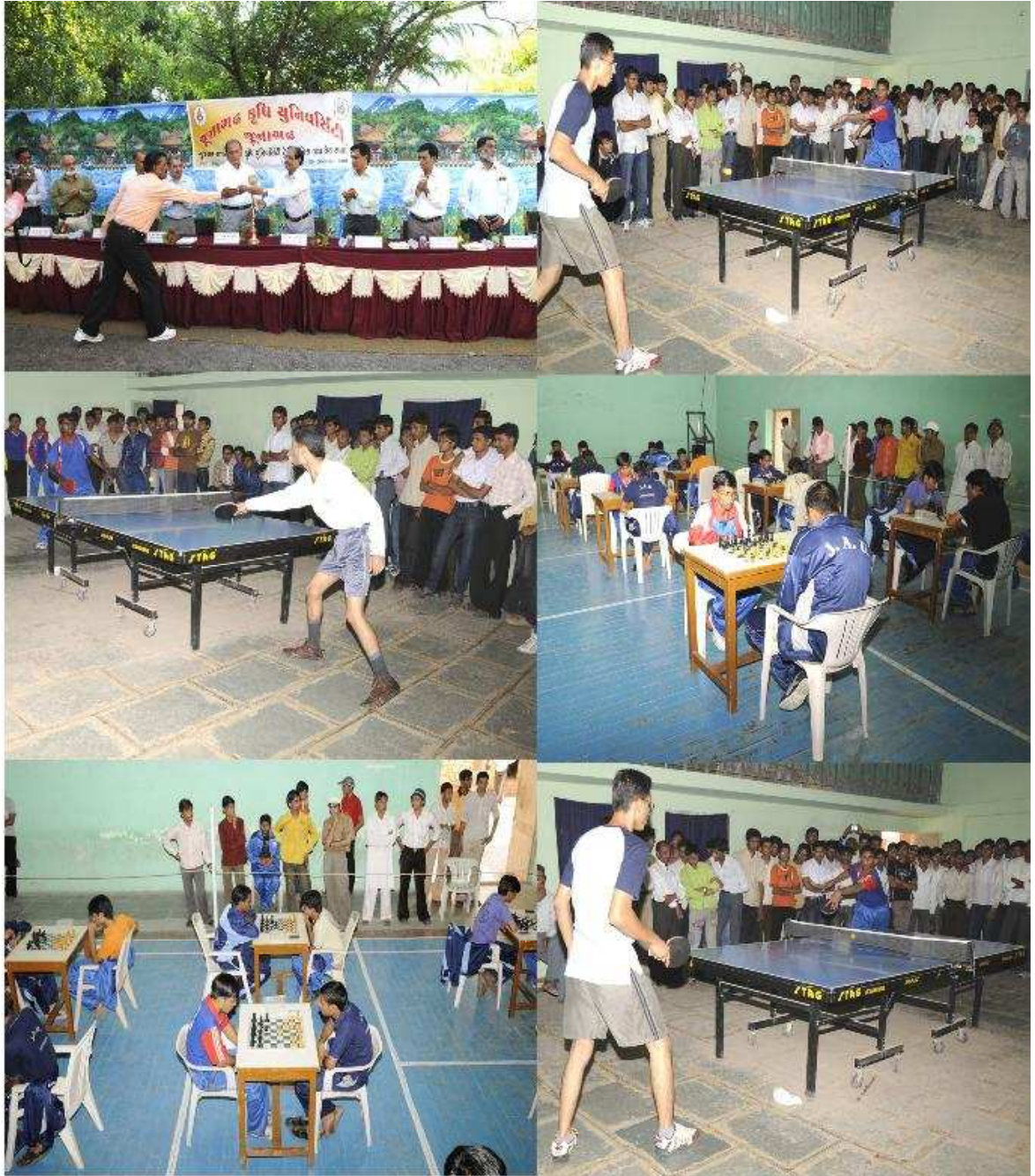
SAUs (Guj) Table Tennis-Chess Competition hosted by J.A.U., Junagadh dt.19,20 Sept. 2009