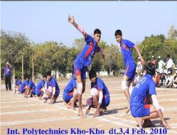
Int. Polytechnics Kho-Kho dt.3,4 Feb. 2010