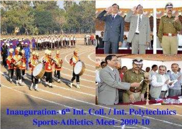
Inauguration- 6 th Int. Coll. / Int. Polytechnics Sports-Athletics Meet- 2009-10