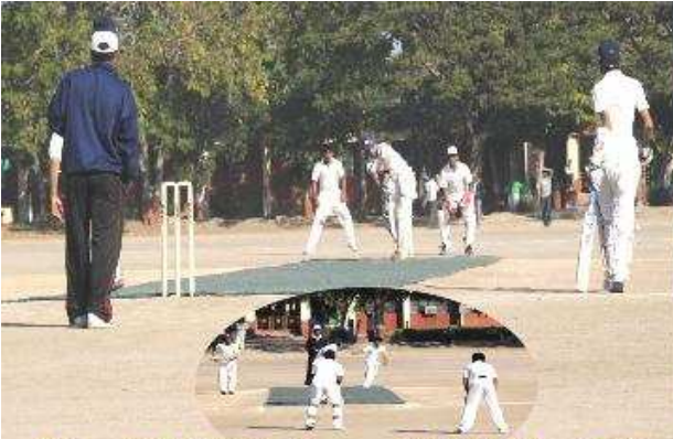
Inter Coll. Cricket tour. dt.22,23 Jan. 2010