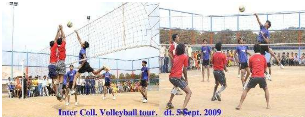
Inter Coll. Volleyball tour. dt. 5 Sept. 2009