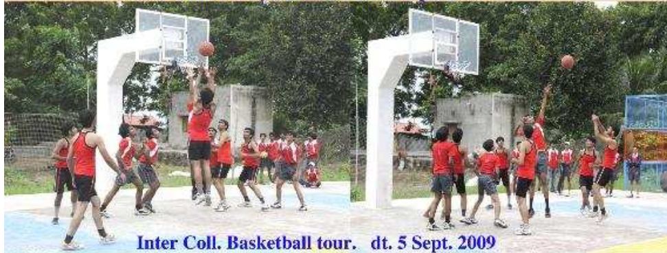
Inter Coll. Basketball tour. dt. 5 Sept. 2009