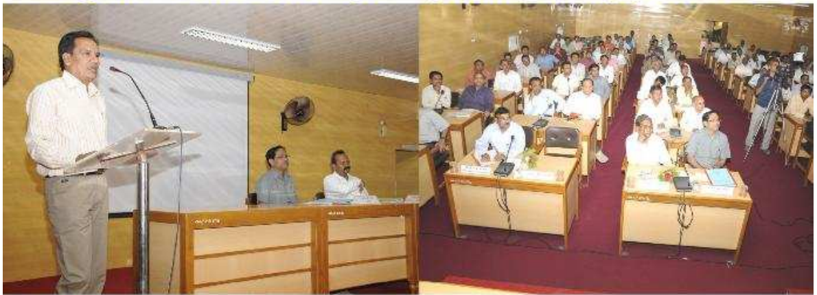
A Lecture on Purchasing process Dt. 4-12-2009