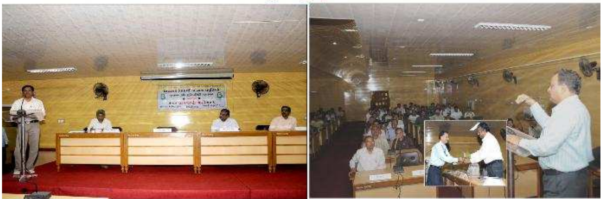
Combo card Presentation by SBI officials Dt. 22-2-2010