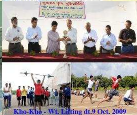
Kho-Kho - Wt. Lifting dt. 9 Oct. 2009