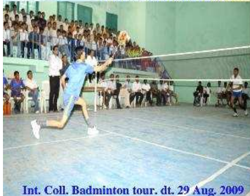
Int. Coll. Badminton tour. dt. 29 Aug. 2009